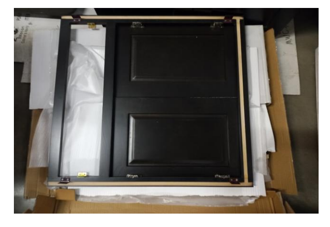
Place 2 Side Panel in Face Frame grooves -Step 2: Use nail gun or L-Bracket and Locking Plate where installed

Step 1: Place Face Frame with attached Door(s) face down on a soft work surface